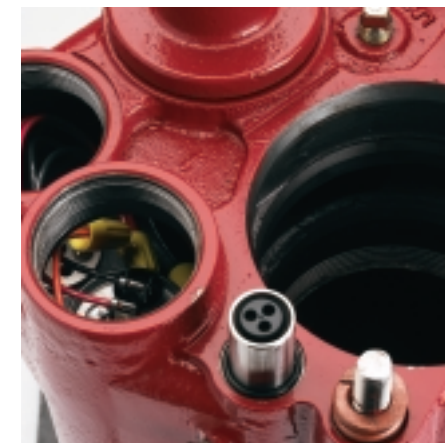
Pre-installed capacitor and simple electrical connections

The electrical connection housing (Contractor's Box) is built into the manifold of The Red Jacket Submersible Turbine Pump, and is completely isolated from the fuel path. Unlike existing systems, there is no adjustment required to fit the yoke, making this pump the easiest to install.