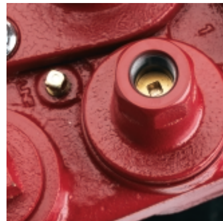
Check Valve pressure release