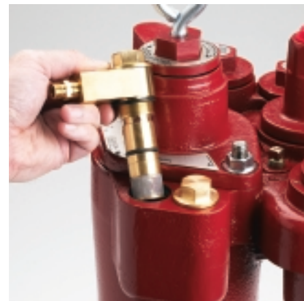
Red Jacket Vacuum Sensor Siphon System